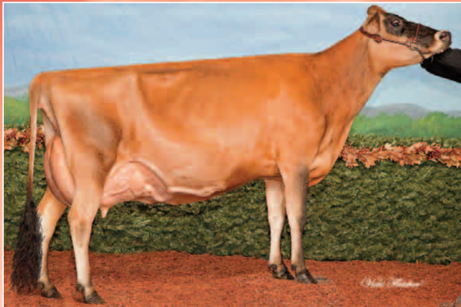
Dtr: Huronia RBR Bree EX96

Ressurrection is siring top conformation cows with great dairy strength and powerful front ends. They are long-lasting cows with good production. Use this sire to bring strength and good conformation into your herd.