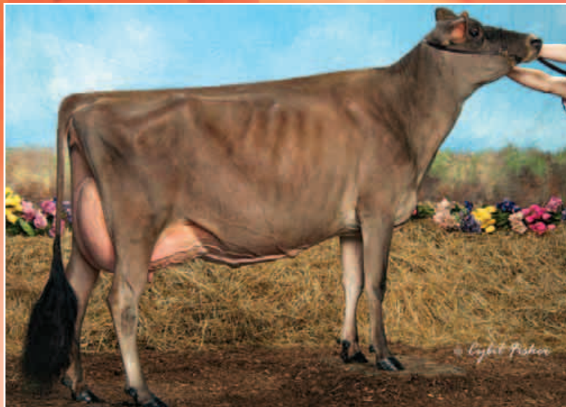
Arethusa Response Vivid-ET EX91

Velocity comes with an exciting pedigree with his two grandams and a great-grandam all National Grand Champions ... a unique package! His dam is one of the hottest young cows of the breed today and this brilliant mating of Jade - Duncan Belle's son, to Vivid - Veronica's daughter, is sure to make Velocity an electrifying young sire to use in your herd.