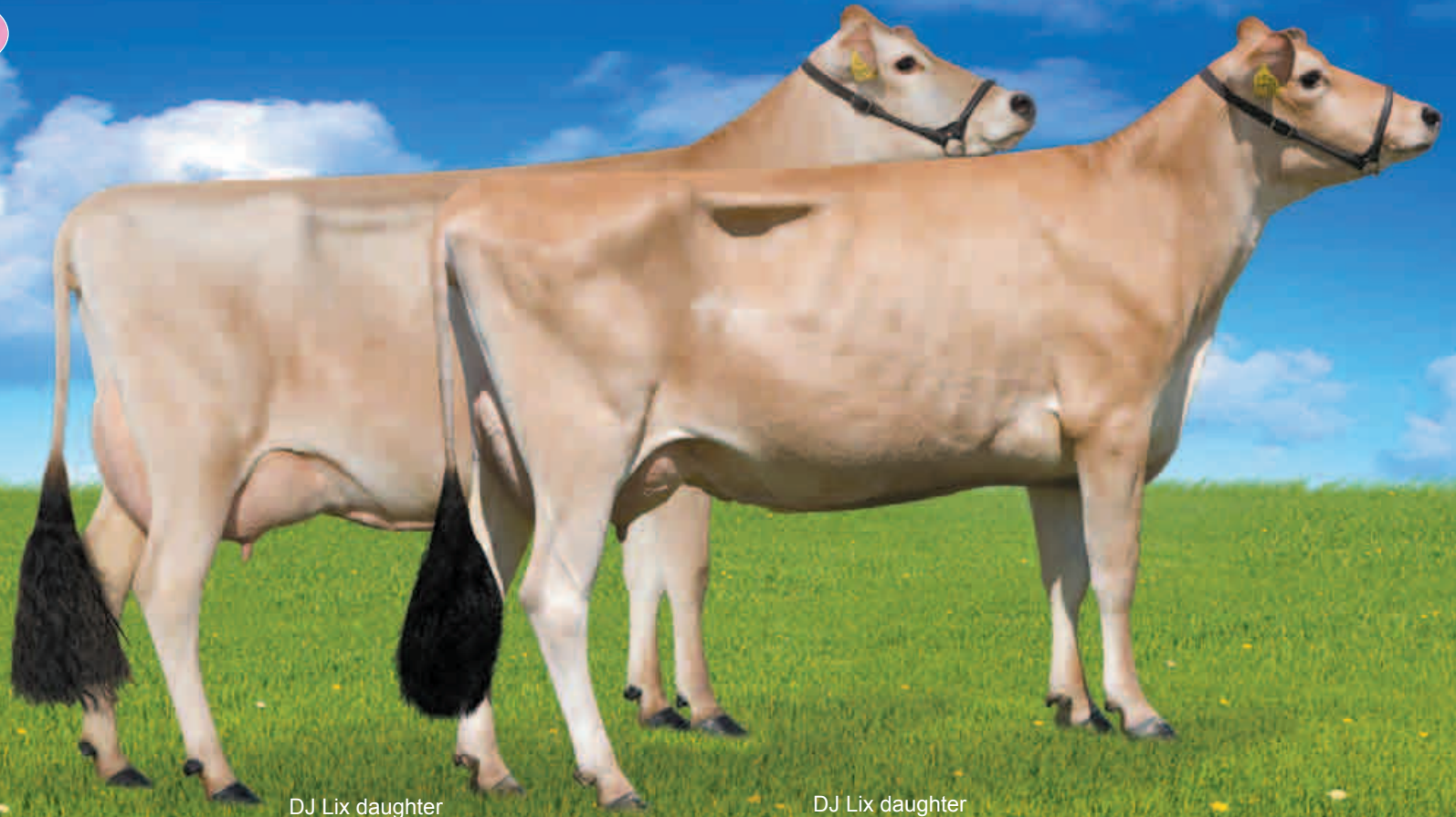
DJ Lix daughter