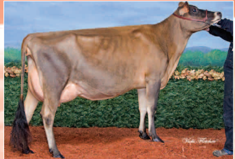
Reagan's full sister: Rapid Bay Connect Roxana

The first daughters of Reagan have calved and are superb young cows with balanced bodies and outstanding udders. Reagan's dam "Rumour" milked well into her 15th year and was placed 2nd Mature Cow at the Royal Winter Fair at twelve years of age! Reagan can be relied on to sire correct type cows with good production and extended longevity