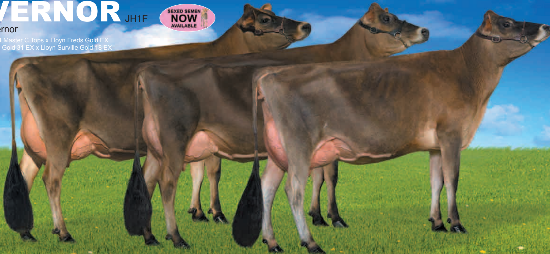
Dtr: Governor Angel of Family Hill