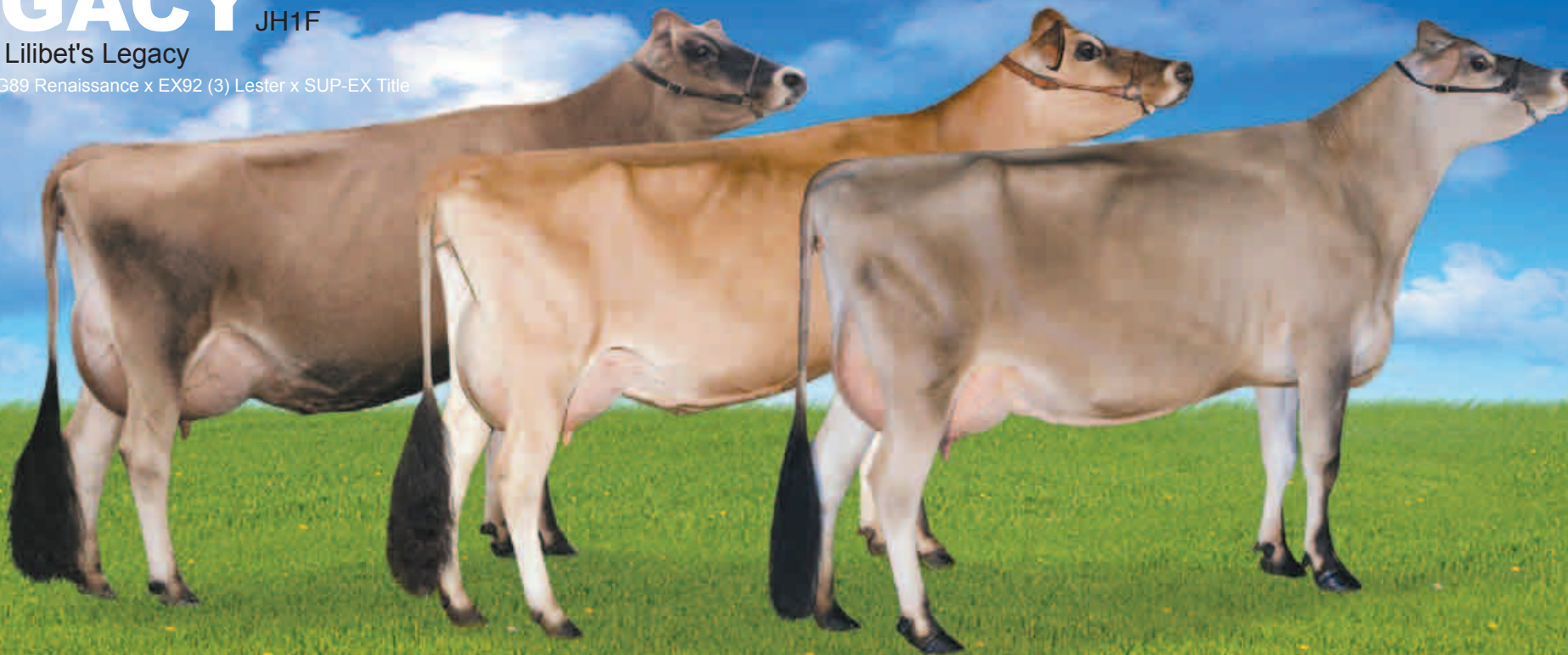
Dtr: Willowa Lilybet Renaissance

Perimeter x VG89 Renaissance x EX92 (3) Lester x SUP-EX Title