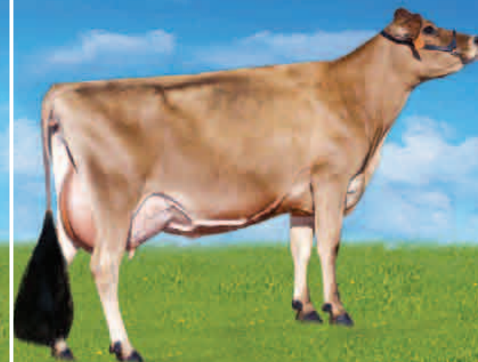
Dtr: Rock Top Success 9702