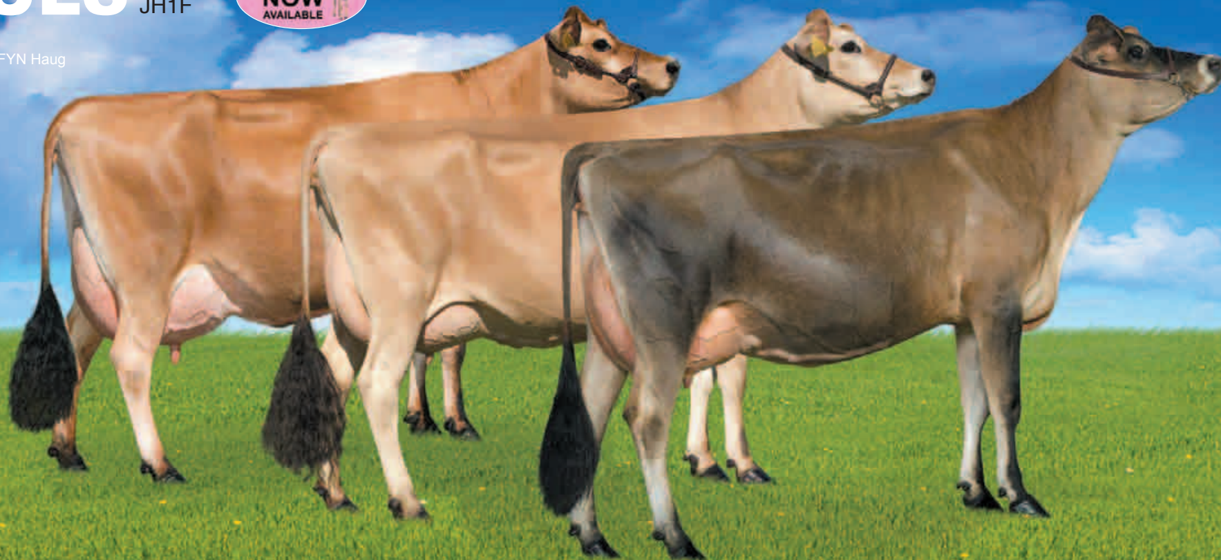
Dtr: Lagangreen Impuls Anneka VG86