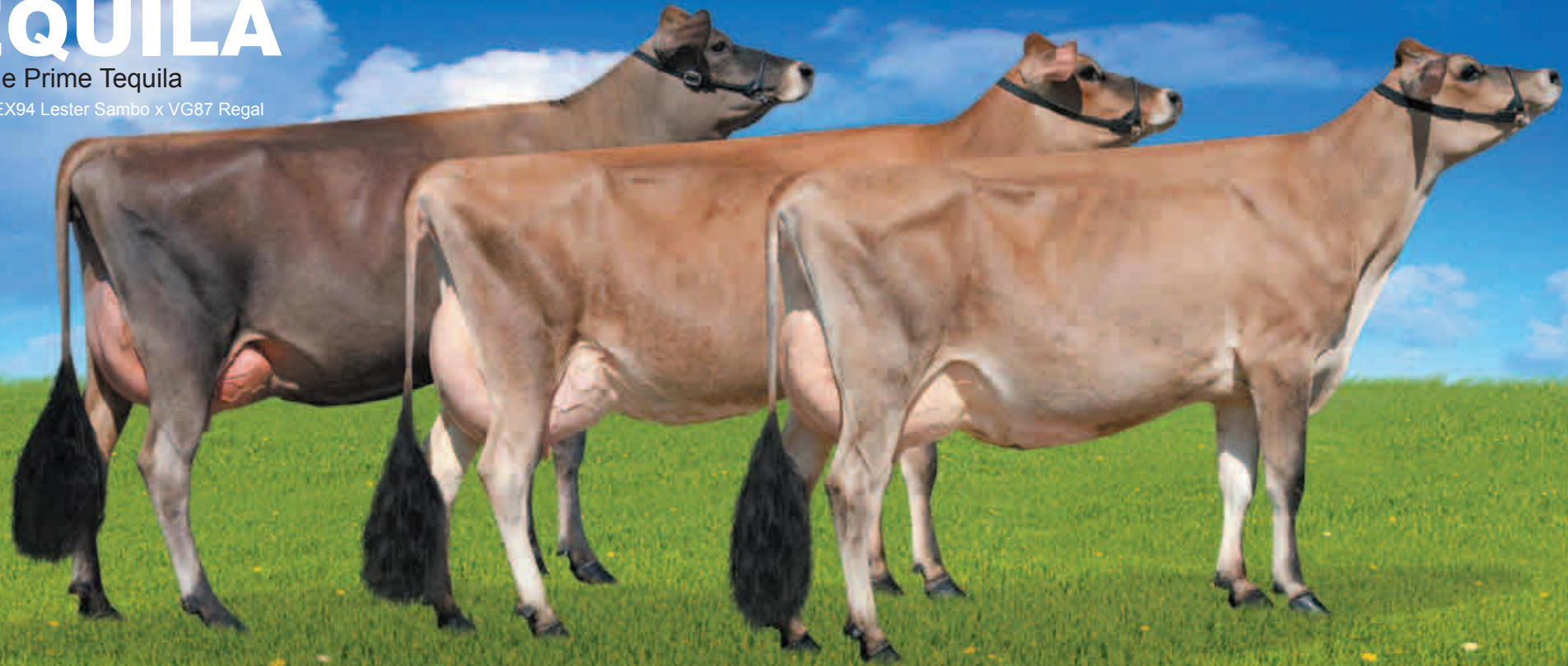
Dtr: Blue Mountain Tequila Tina Marie

Primetime x EX94 Lester Sambo x VG87 Regal