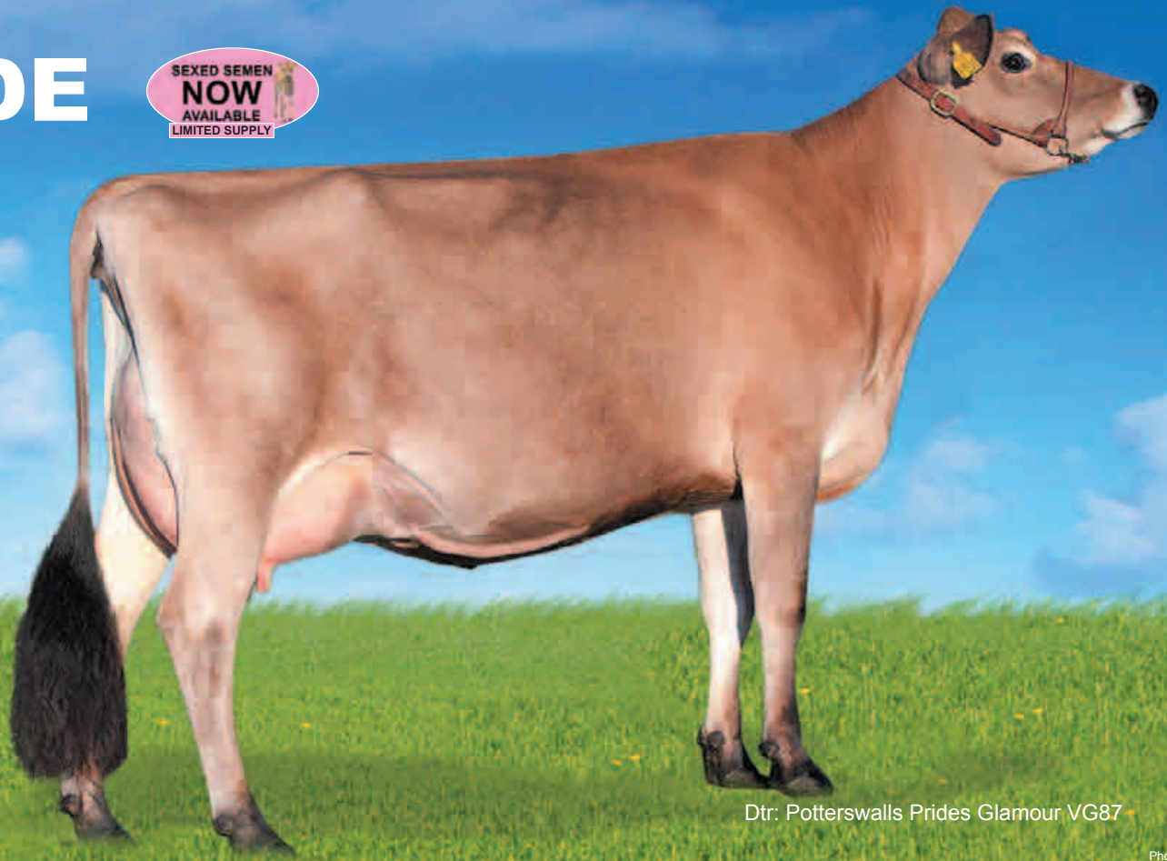
Dtr: Potterswalls Prides Glamour VG87