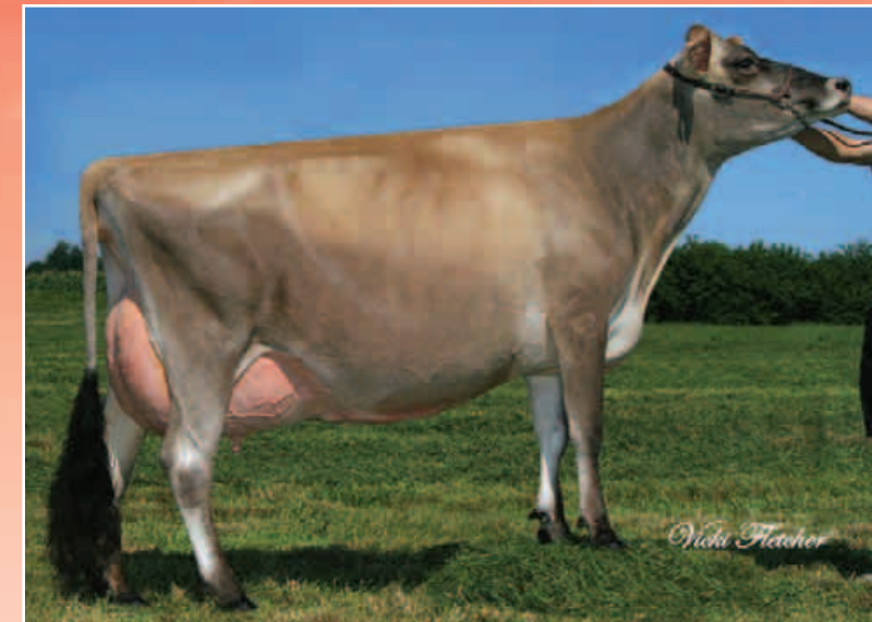
Dam: Vandenberg Amedeo Gorgeous EX97

Gammon is a highly popular young sire in Canada and the USA - he is a son of BW Legion, one of the most successful sires of recent years that left well developed daughters with outstanding dairyness and superb udders. The dam of Gammon is the illustrious "Gorgeous" cow that everyone admires.