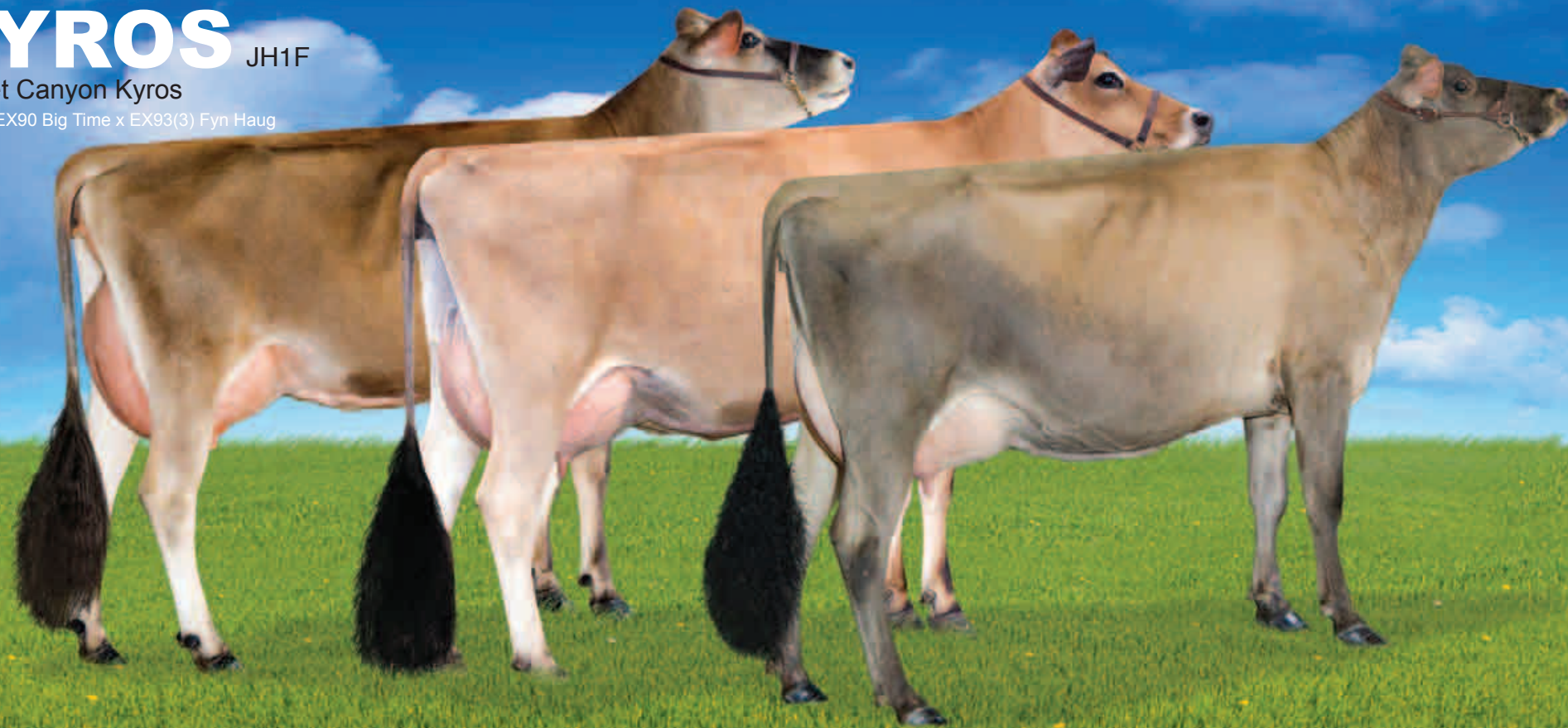
Dtr: WF Kyros Dakota

Action x EX90 Big Time x EX93(3) Fyn Haug